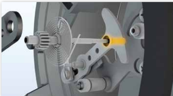
1279 PLUS! shown above

Standardizing on PLUS! ™ Performance allows buyers to reduce the amount of SKUs while maintaining their facilities safe and attending the demand of their processes.